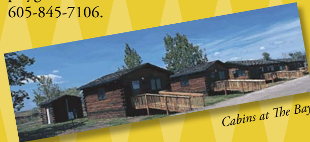
Cabins at The Bay

(The Bay) A season of sun awaits you at the Grand River Casino & Resort. The Bay, just northwest of Mobridge, has six cabins available, over 70 camp sites, electrical hookups, showers, RV dump station and a playground. For more information call 605-845-7106.