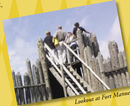
Lookout at Fort Manuel

A new historic site tops the list of places to see along the Standing Rock Native American Scenic Byway. The newly reconstructed Fort Manuel is located at Kenel, South Dakota — just 7 miles south of the North Dakota/ South Dakota border. The log outpost, constructed in 1811 by fur trader Manuel Lisa, is faithfully reproduced at Kenel, within one mile of the scenic byway route. Guarded by the Hunkpapa Lakota people is the nearby resting place of Sakakawea, the Shoshone guide of Lewis and Clark, who died at Fort Manuel in 1812.