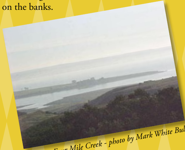
Four Mile Creek

The Journals of Lewis & Clark - 14th of October Sunday 1804—Camped in a Cove of the bank on the S.S. immediately opposite our Camp on the L.S. I observe an ancient fortification the Walls of which appear to be 8 or 10 feet high, (most of it washed in) the evening wet and disagreeable, the river something wider more timber on the banks.