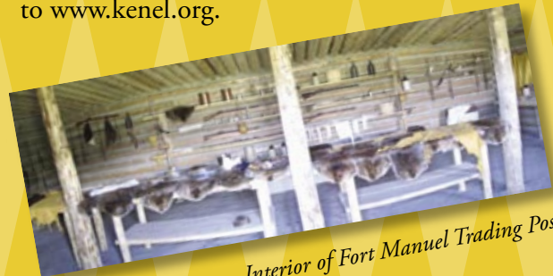
Interior of Fort Manuel Trading Post

Fort Manuel Lisa is open May 1st through October 31st. Hours of operation are 10:00 a.m. to 6 p.m. Monday through Sunday. Go to www.kenel.org .